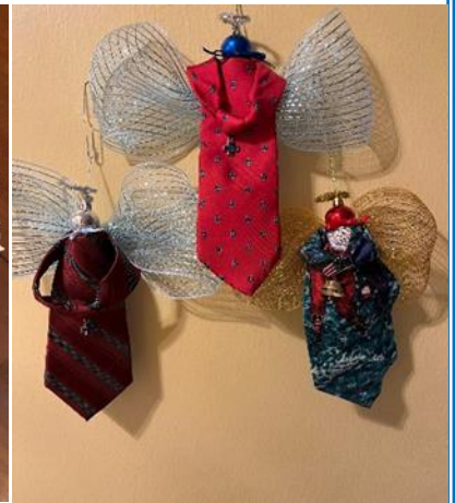
"Angel Buddies" made with donated ties