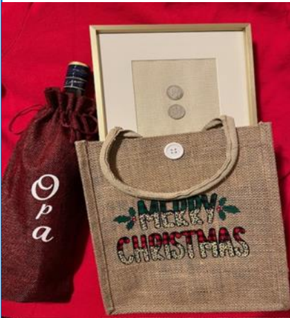
Framed 1873 Greek coins and embellished gift bags

A small sample of some of the items that are being offered at the YiaYia's table are pictured below: