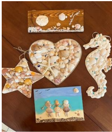
Handmade items made with seashells